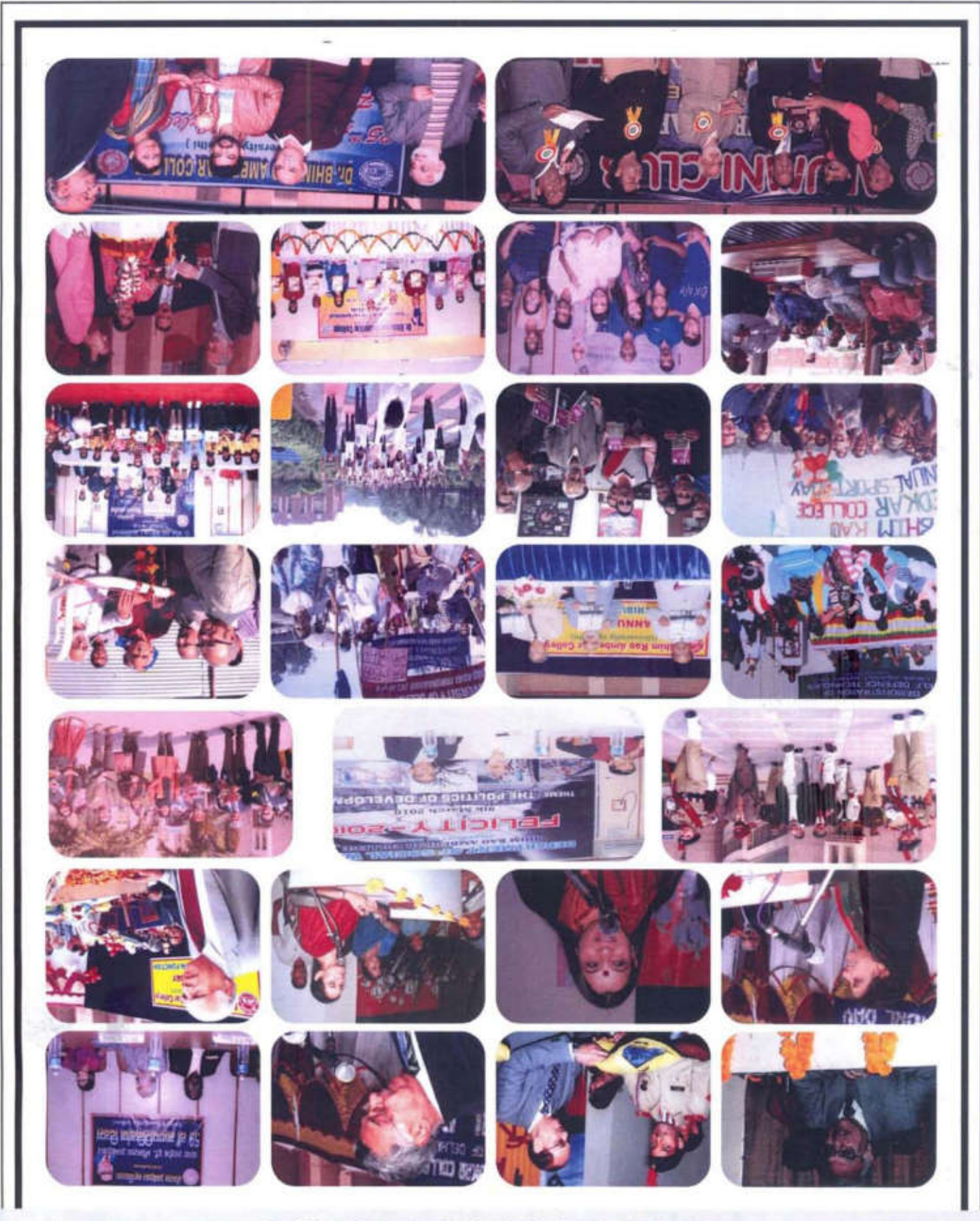
CLIMPSES OF COLLEGE LIFE