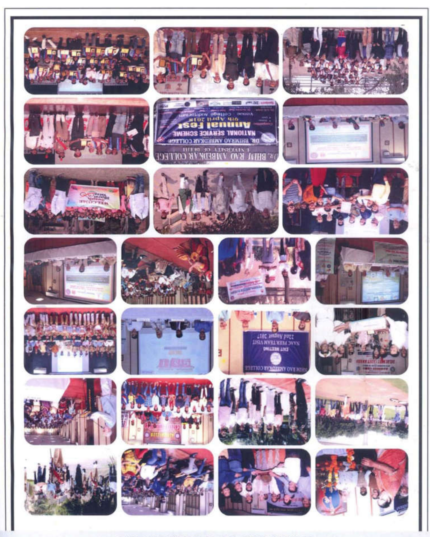
CLIMPSES OF COLLEGE LIFE