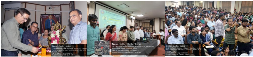
19 th Babasaheb Dr. Bhimrao Ambedkar Memorial Lecture (15 th April, 2025)