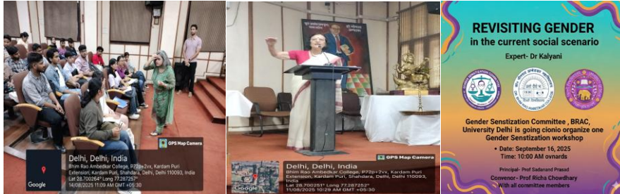
Activities by Department of Social Work