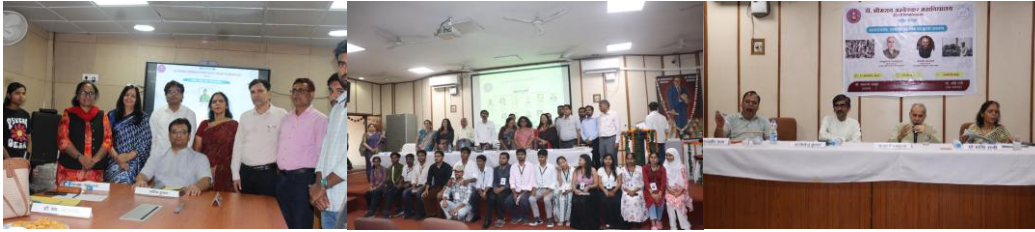
Activities by Department of Hindi Journalism and Mass Communication