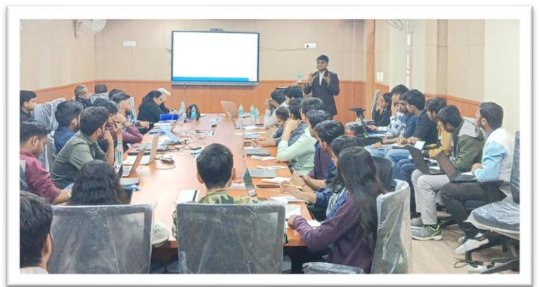
Activities by Department of Business Economics