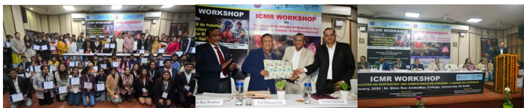
Three-day ICMR National Workshop (20 th to 22 nd January, 2026)