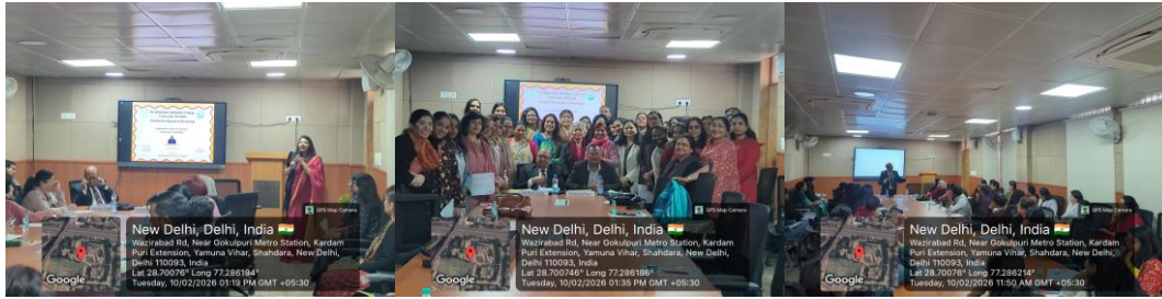
IQAC Workshop on ‘Quantitative Data Treatment’ (10 th Feb, 2026)