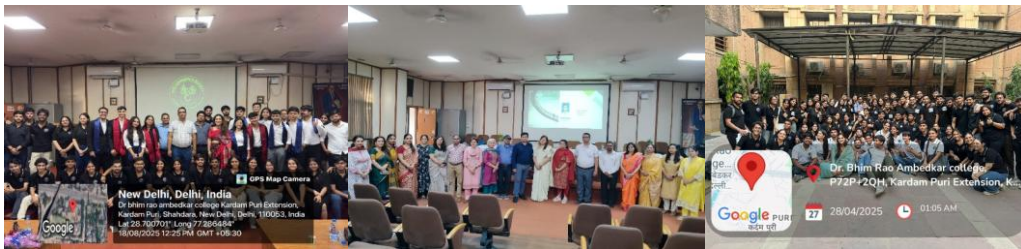
Activities by Department of Commerce