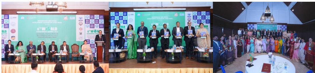
6 th World Environment Summit 2025, Bangkok, Thailand (8 th to 12 th November, 2025)