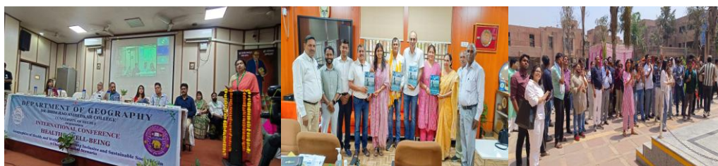
Activities by Department of Geography