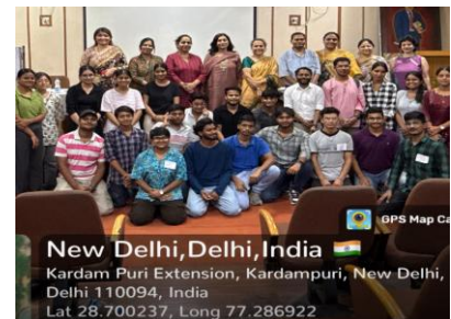
Activities by Gender Sensitization & Women Development Committee