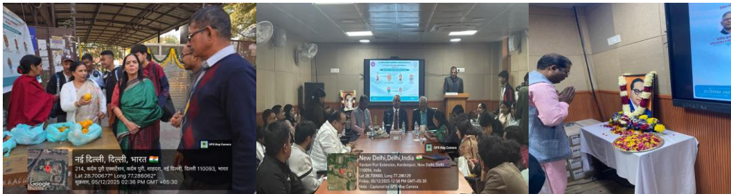
Memorial Lecture on 'The Relevance of Dr. B. R. Ambedkar in the Present Context' (Mahaparinirvan Diwas, 5 th December, 2025)